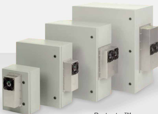
Protector™ Air Conditioned Enclosures