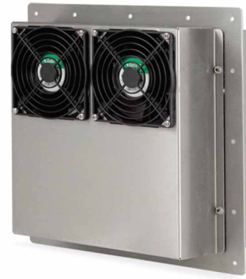
ThermoTEC™ Thermoelectric Air Conditioner